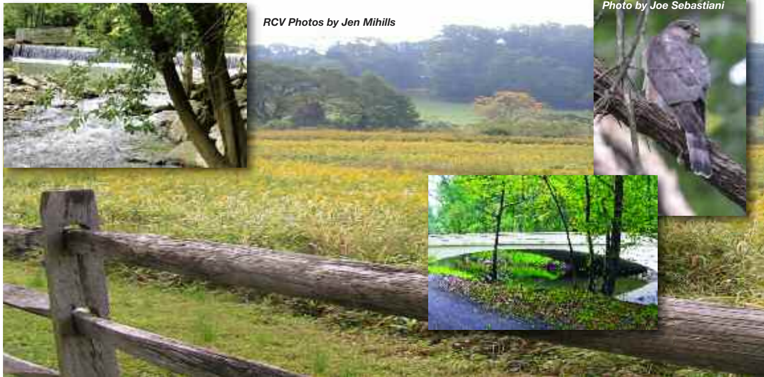
RCV Photos by Jen Mihills

While numbers tell only part of the story, the Byway contains 94 identified visual accents, 11 vista points, 117 historic resources, and innumerable natural resources and stream tributaries that together form "a place of uncommon beauty and very special significance."