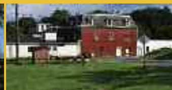
Cooch-Dayett Mills 904 Old Baltimore Pike, Newark, 302-239-2334