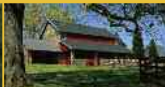
Coverdale Farm 543 Way Road, Greenville, 302-239-2334