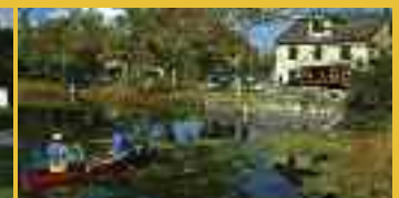
Abbott's Mill Nature Center 15411 Abbott's Pond Road, Milford, 302-422-0847