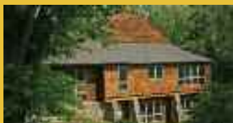
Ashland Nature Center 3511 Barley Mill Road, Hockessin, 302-239-2334